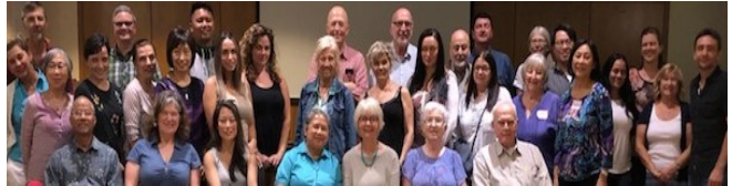
ALPHA finale—September 6th, 2018