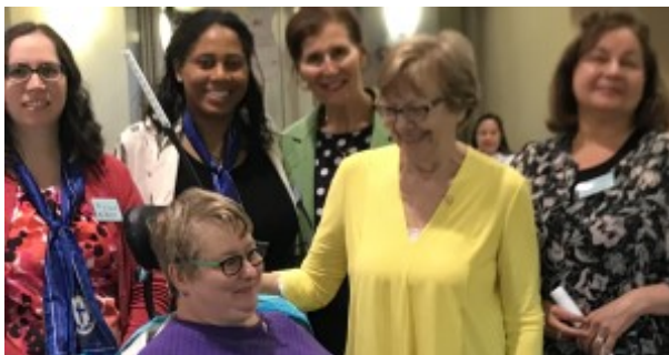
CWL Service Pin Awards & Sisterhood Luncheon