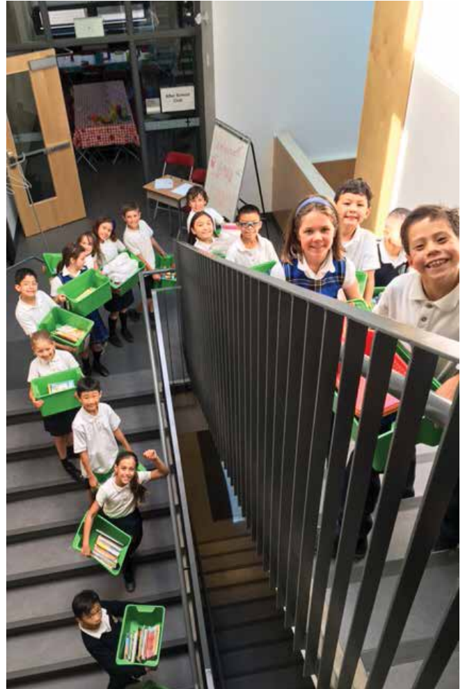
Moving on up: students carry boxes up to the newly-completed third floor in June.